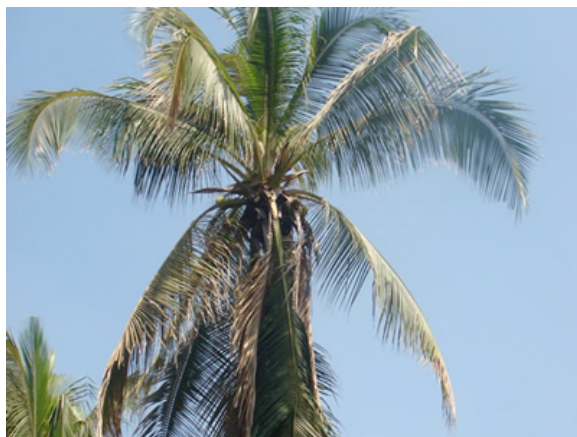
3 to 4 youngest leaves remain green at the centre

Damage symptoms: Dried up patches on leaflets of the lower leaves. Galleries of silk and frass on underside of leaflets.