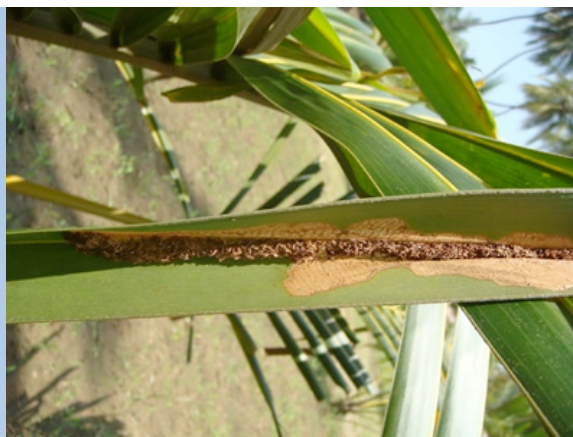
Galleries of silk and frass on underside of leaves