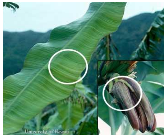
Mottling and streaking of banana leaves and flowers due to cucumber mosaic virus

Intermingling patches of green and light green or pale green or yellowish colour on the leaves is known as mosaic.